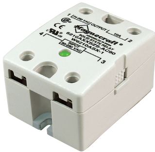
6000 Series Relays